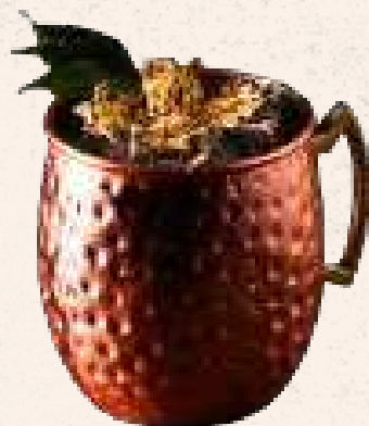
SUSEGAD DRIFT 285.-

Masala chai decoction, Citric, bitters, Whisky