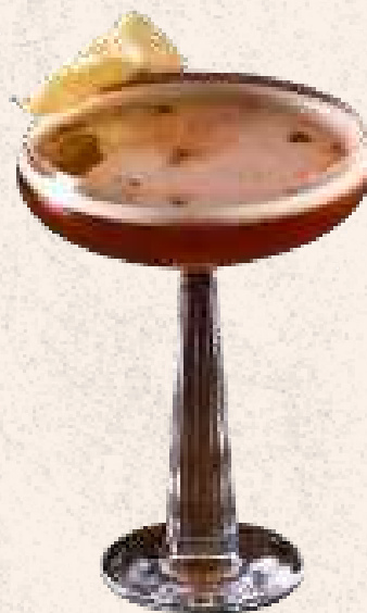
DELHI BELLY 285.-

Betel Leaves, Saffron Honey Water, Lime Tequila