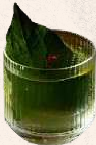
BANARASI PAAN 285.-

Pineapple, Curry Leaves, Coconut, Lime Ginger Ale, Gin