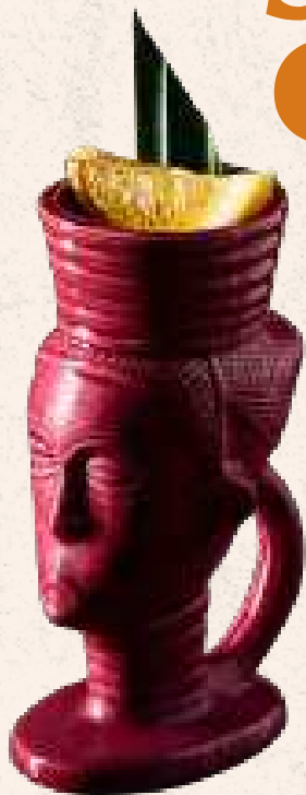
MADRAS HEAT 285.-